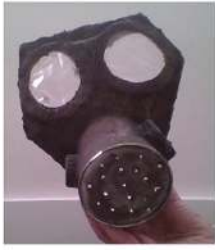
WW2 Gas Mask