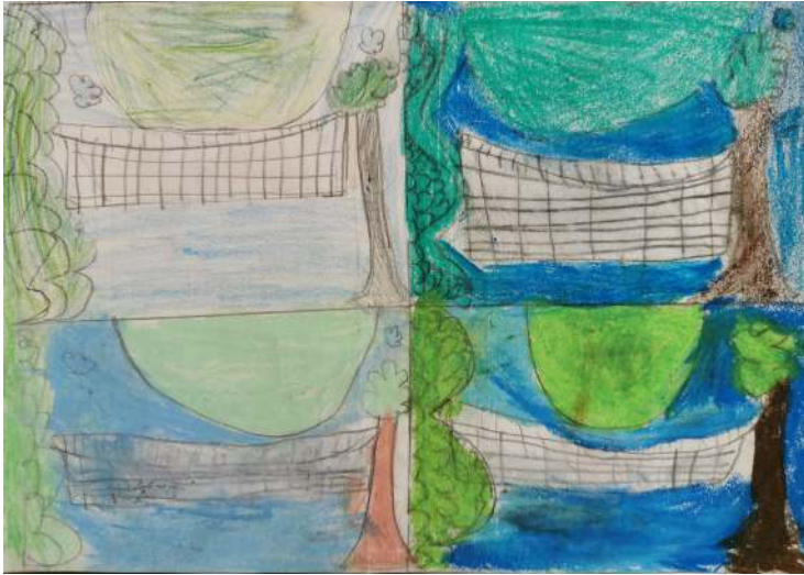
Labaik (North America)

Crime and punishment Design an information leaflet informing people of the kinds of punishment that there were in the past. What kind of crime 'deserved' the punishment they merited? You could write about: Whipping, the stocks, the pillory, hanging, the rack, the block, the guillotine, the execution chair, the stocks, whipping, etc.