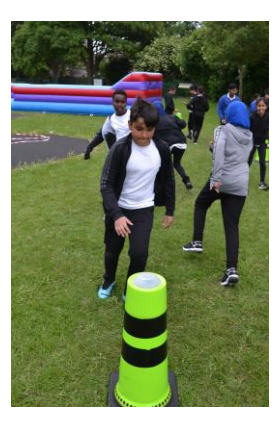
Quick as a flash

One of the most popular activities on offer throughout the week was climbing. The determination and concentration which the children displayed as they tried their very best to reach the summit was absolutely fantastic. The way in which some children scaled the wall was absolutely astonishing. One year 6 child got to the very top in approximately 10 seconds! The speed and strength shown by this individual was amazing. Well done children.