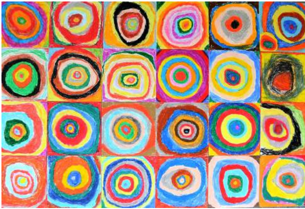
South America class