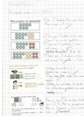
Al Qabila (Hepworth)