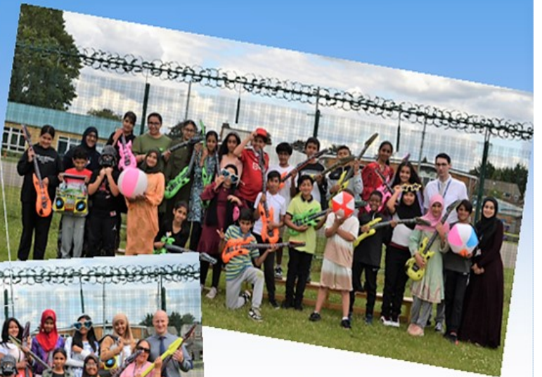
WAI Year 6 Leavers 2023