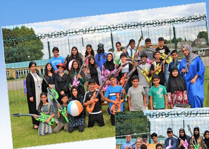
WAI Year 6 Leavers 2023