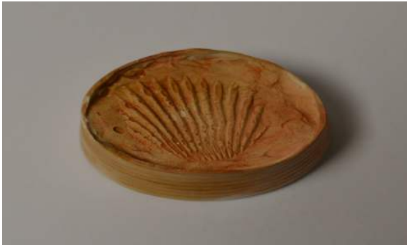
Baker - Israr